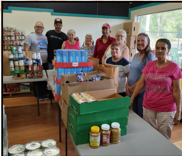
Some of the Senior Blessings program volunteers