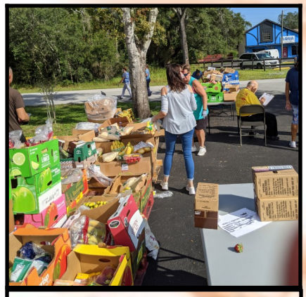
Volunteers sort produce for distribution

Maybe it's the fresh produce we get from Feeding Tampa Bay for our monthly mobile distribution, or perhaps it's the dairy and meat dona-