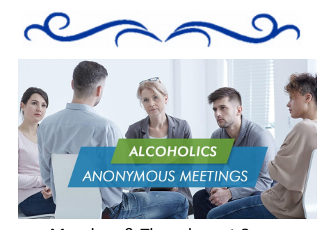
Mondays & Thursdays at 8 pm at our HELP Center 1396 Kass Circle, Spring Hill.

We're not a pantry, as we don't give out boxes of food regularly but if you need pantry items please take a look at the list of Hernando County pantries which can be found on our website: www.phphernando.org/resources.